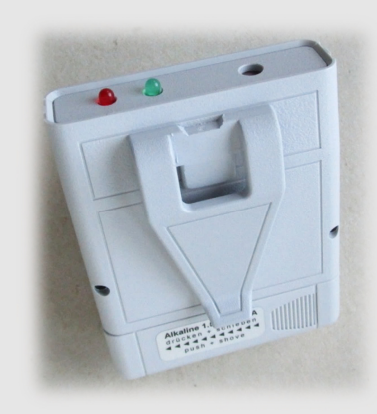
pocket clip on the back